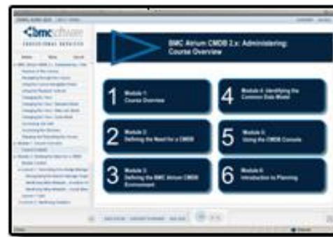
The user-friendly Web-based training interface allows students to navigate through their lessons with ease.